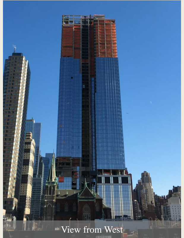
View from West