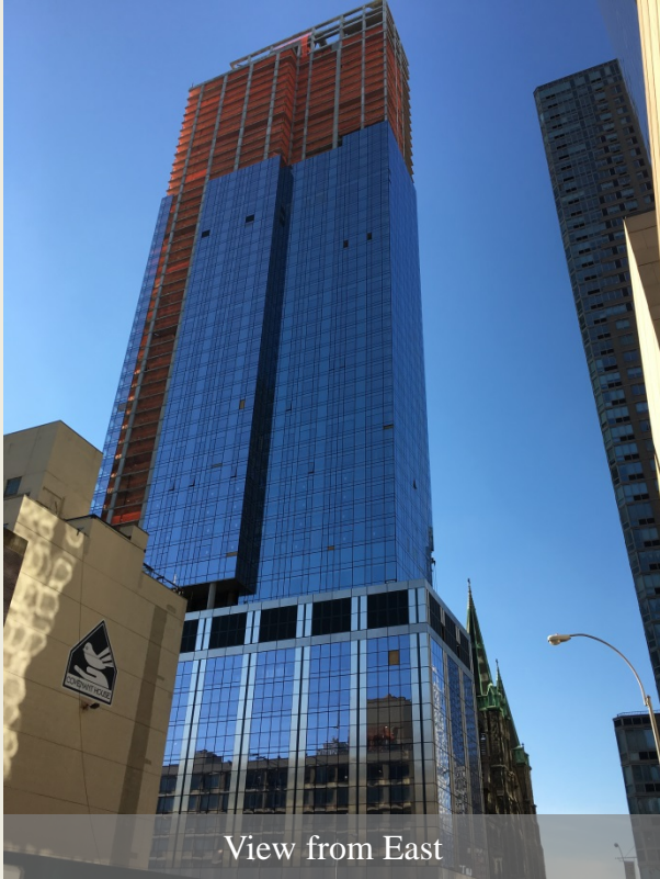
View from East