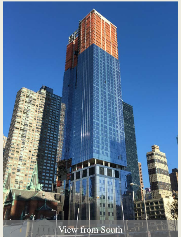
View from South