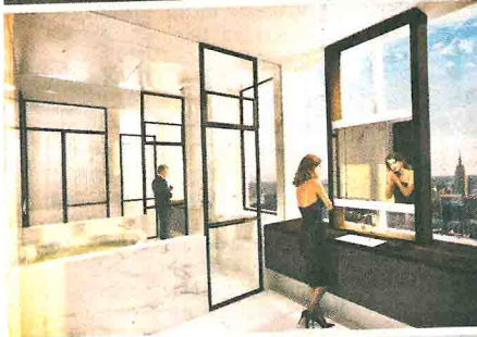
Duplex penthouse is epitome of luxury. More than 10,000 square feet of living space, rich materials and a view that is simply to die for.