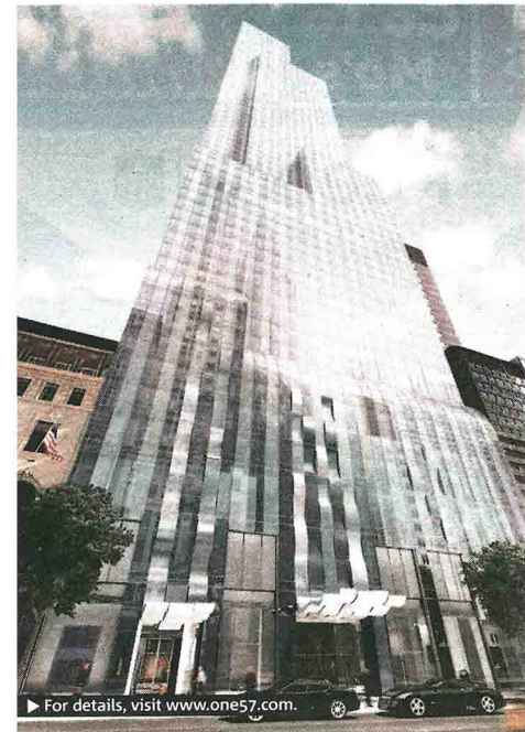
► For details, visit www.one57.com .

with a skyscraper-size price tag. Units start at a little over $7 million, and the six-bedroom, 10,923-square-foot duplex penthouse priced — at $115 million — could potentially be the most expensive apartment in New York.