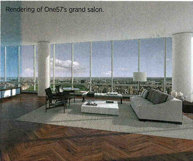
Rendering of One57's grand salon.