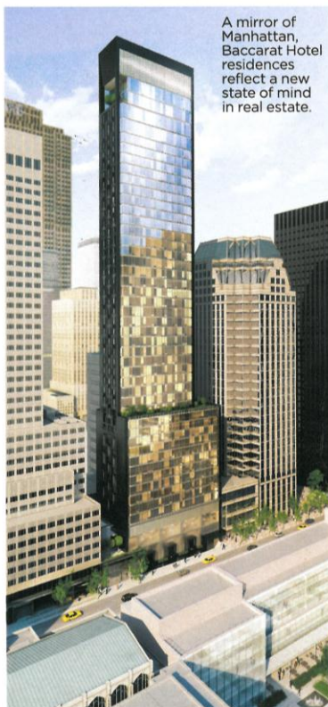
A mirror of Manhattan, Baccarat Hotel residences reflect a new state of mind in real estate.

Just across First Avenue from the United Nations Secretariat Building yet another luxury tower is