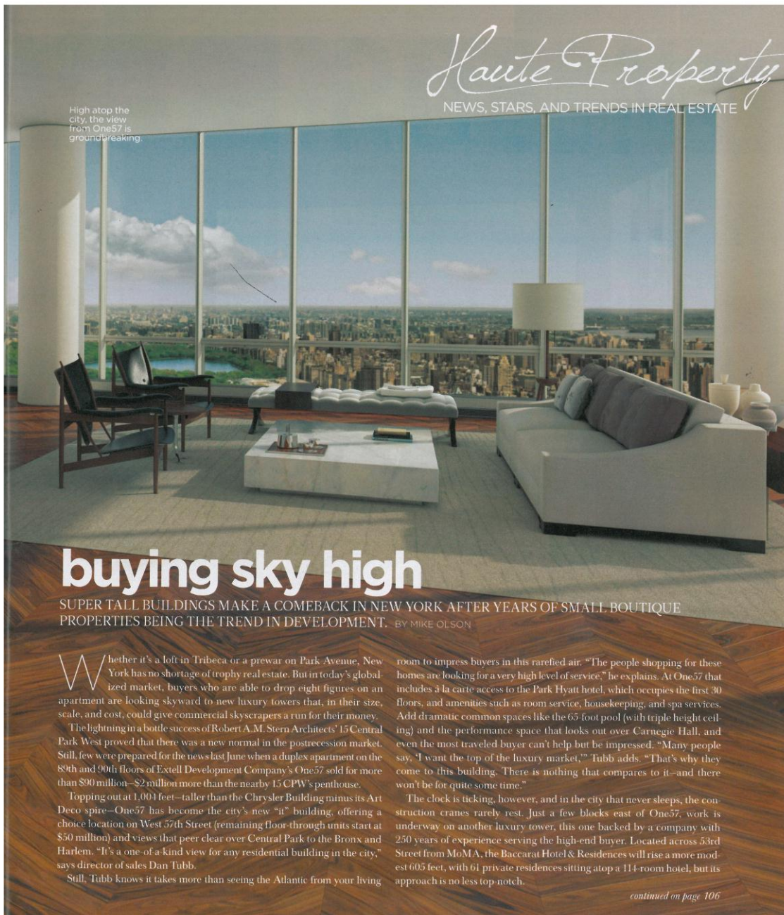
High atop the city, the view from One57 is groundbreaking.

Haute Property NEWS, STARS, AND TRENDS IN REAL ESTATE