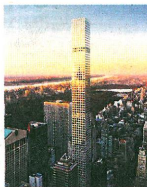
DBOX FOR CIM GROUP AND MACKLOWE PROPERTIES

And an additional 20 or so are under construction or in plan-